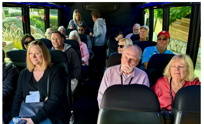
Tour guests used our complimentary Shuttle Buses which helped transport over 500 tour guests and volunteers through the tour route