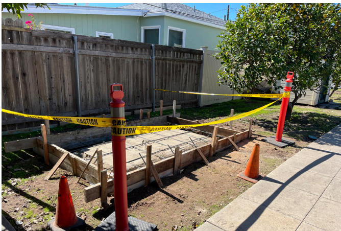
Construction has begun on the display shed and the shade trellis.

If you would like to help us cross the finishline please consider making a gift to the landscape campaign. You can mail in a check to our PO Box 882, La Mesa, CA. 91944 or donate with this website link https://lamesahistory.com/product/variable_donation/ . All variable donations will count toward the campaign. Thank you for your support (and your patience.)