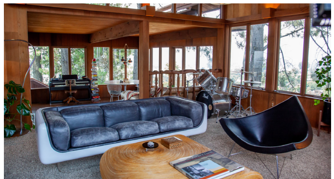
Two of the Mid-Century homes that featured both exquisite exterior and interior settings.