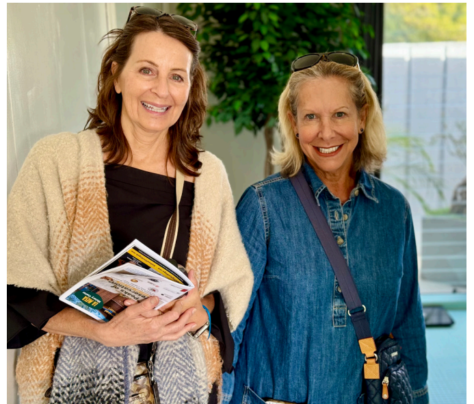
Above, right: Smiling guests reflect the positive attitudes and experiences of this year's Home Tour.