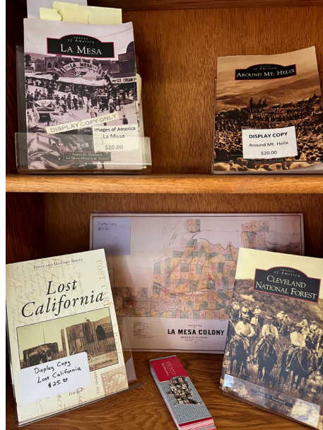
Stop by the archives and buy a book on area history.