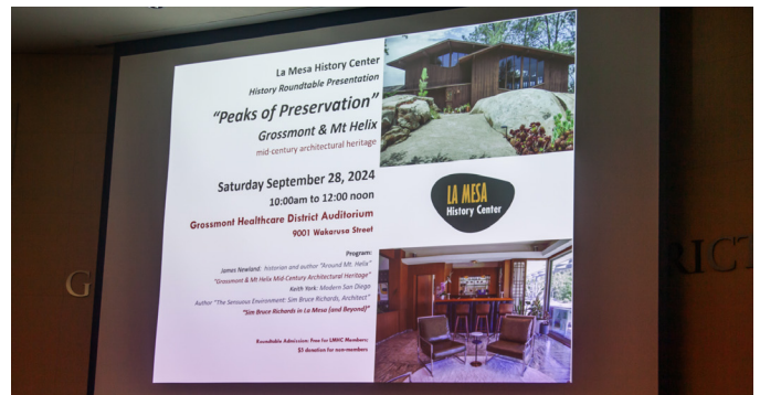
Roundtable title slide.

If you were not one of the Roundtable Lecture attendees, do not fear.